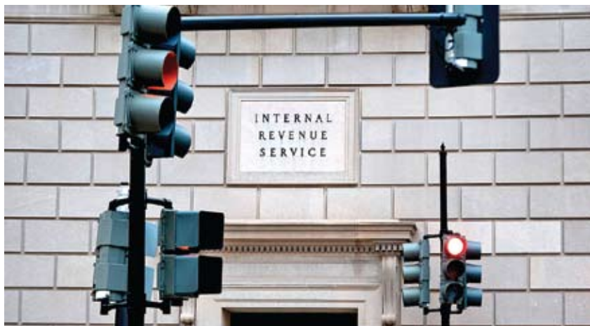
IRS headquarters in Washington on Feb. 26, 2022.

on the House Ways and Means Committee, in a statement. “Every retailer in the United States who cares about their hard-hit customers should be fighting to block this unnecessary harassment of hard-working Americans.”