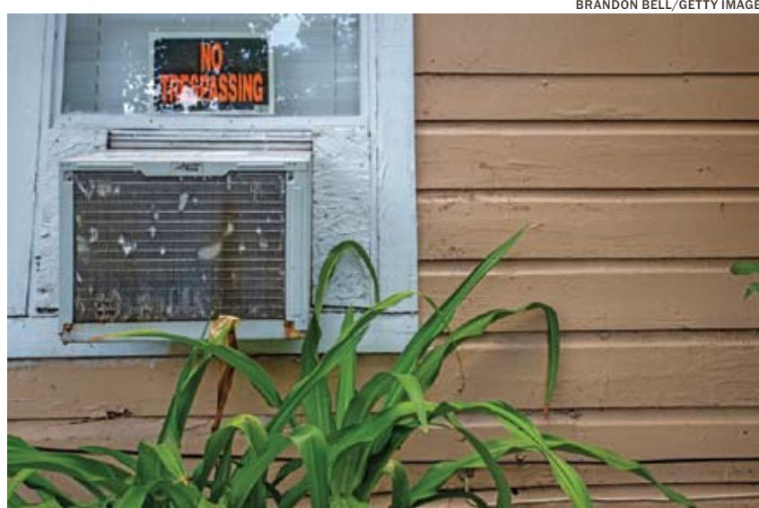
▶ A window air conditioning unit in Houston on July 21, 2022.

spections, has been servicing the New York metropolitan area for the past 14 years.