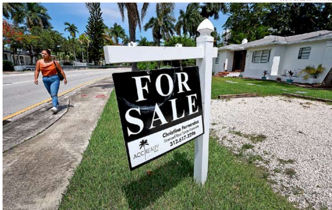
▲ A "For Sale" sign in front of a home in Miami on June 21, 2022.