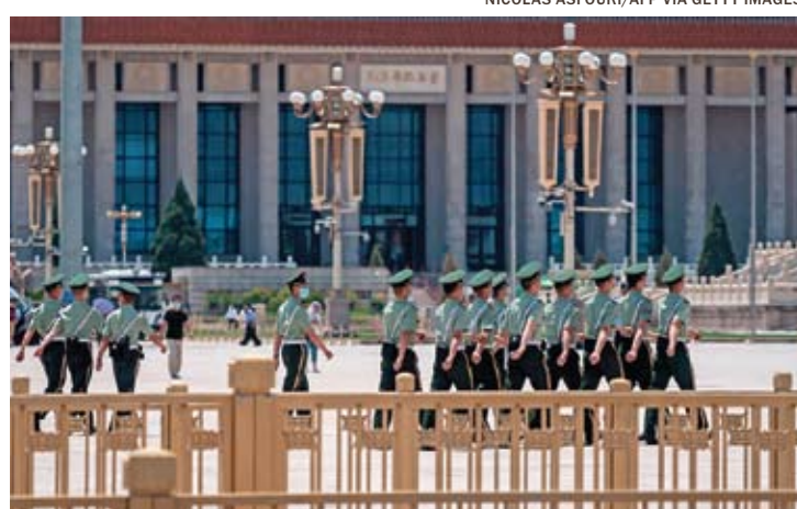
Paramilitary police officers march at Tiananmen Square in Beijing on June 4, 2020.

By defending our rights, we are fighting for democracy and freedom, which is our greatest hope in life.