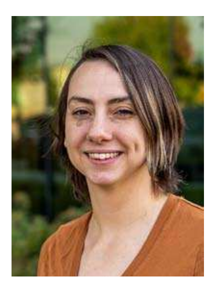
PUD Planner/Coordinator U.S. Navy