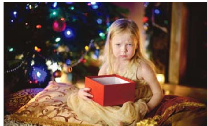
As you look for that perfect gift, don't overlook presents that have long-term benefits.

should they develop a life them into a quilt. They may