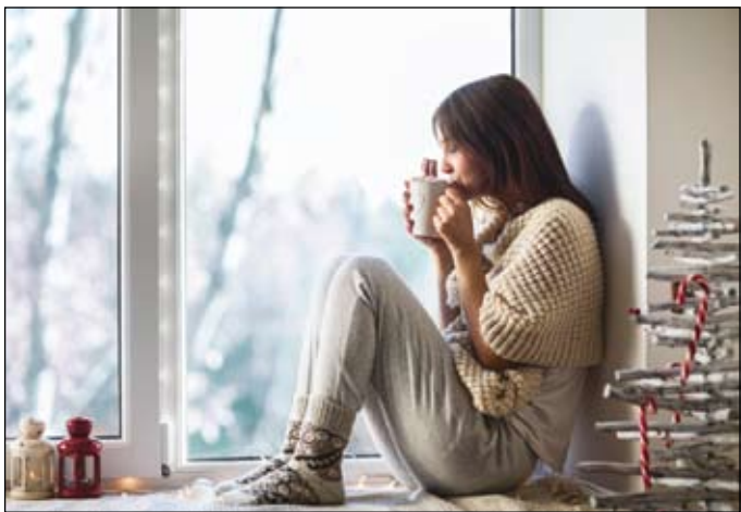
While it can be hard to set aside time in your schedule when there's so much to do, a bit of daily self-care is sure to have a restorative effect that helps you refresh, reset and be more focused.