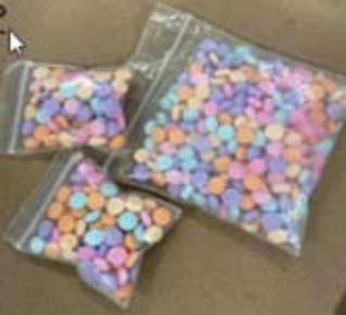
Rainbow Fentanyl pills have been confiscated by law enforcement in the Wenatchee Valley within the last month.