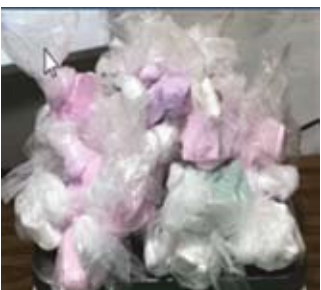
Fentanyl chalk.