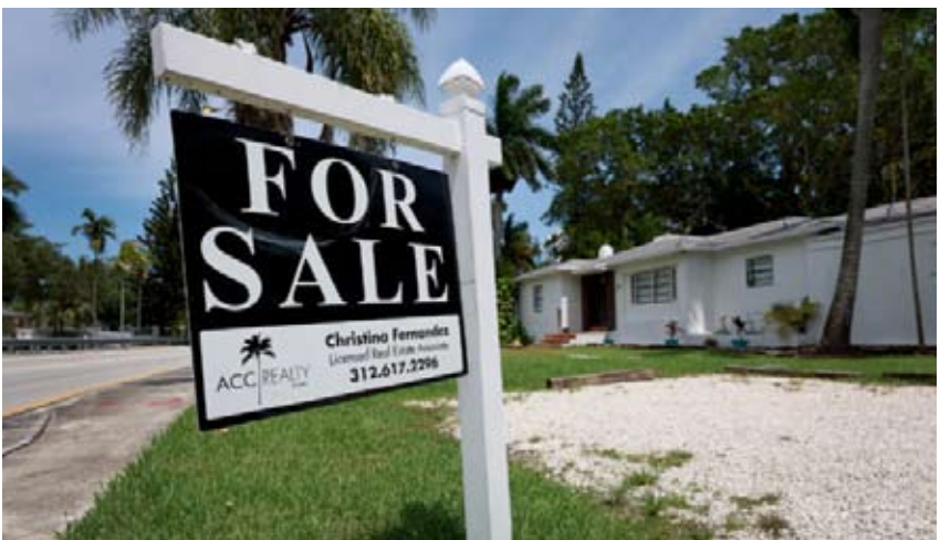
A ‘for sale’ sign hangs in front of a home in Miami, Fla., on June 21, 2022.