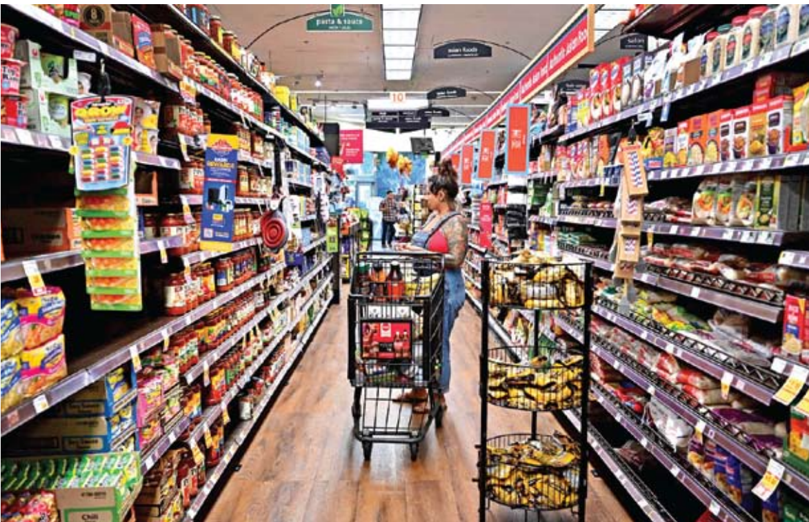
A woman shops for groceries at a supermarket in Monterey Park, Calif., on Oct. 19, 2022.

▶ Residential homes under construction in Valley Center, Calif., on June 3, 2021.