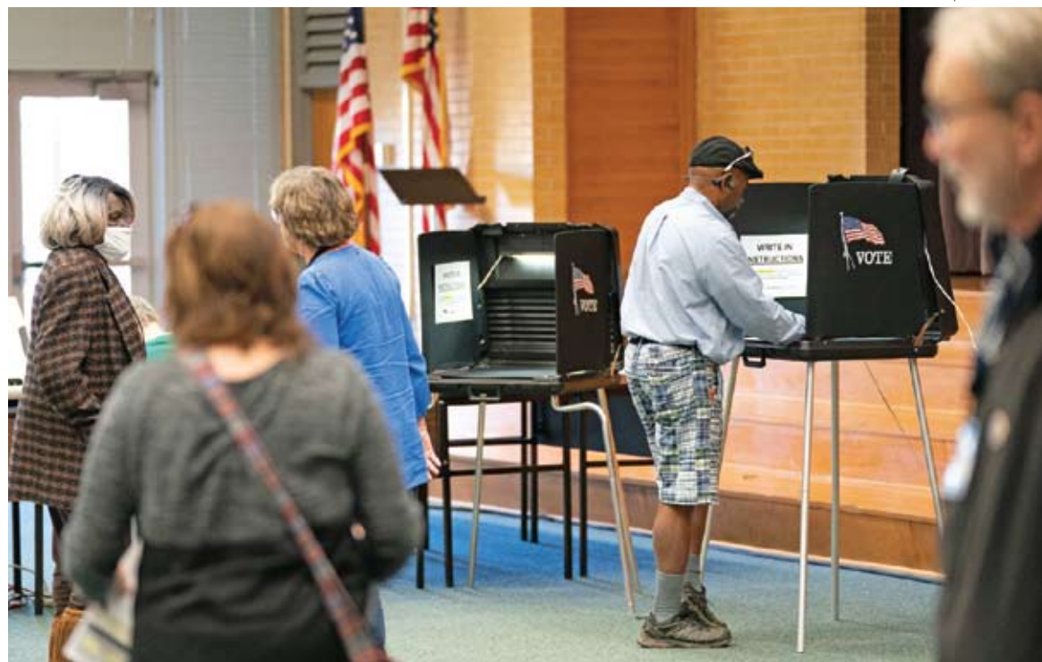
A voter fills out a ballot in Winston-Salem, N.C., on Nov. 8, 2022.

Moore is appealing the Supreme Court of North Carolina's order redrawing the state's electoral map against the wishes of the state's Republican-majority legislature.