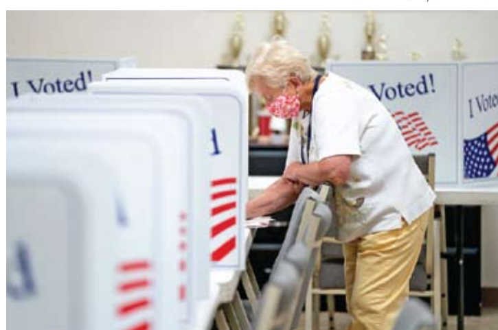
A woman votes at a polling booth in Norwood, N.C., on May 17, 2022.

On an RCV ballot, voters aren't limited to picking one candidate, and a winner isn't declared until one candidate receives more than 50 percent of the votes.