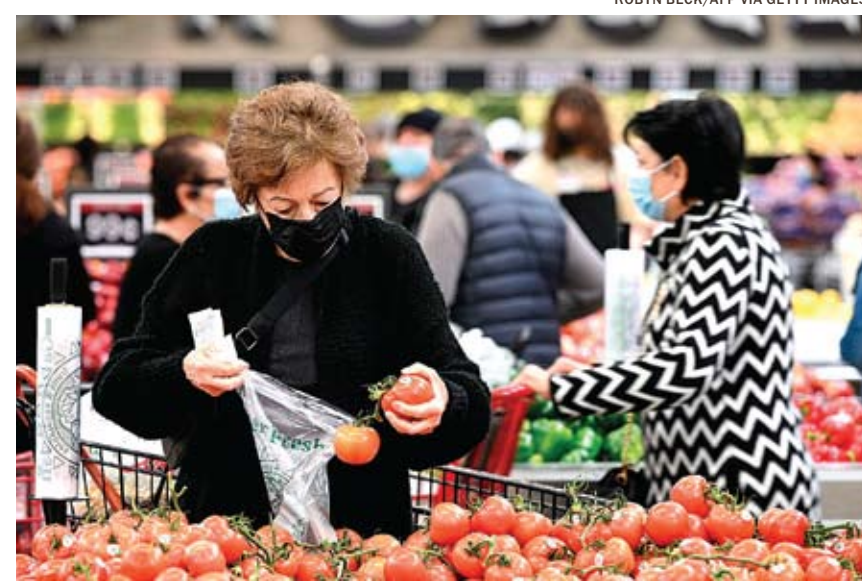
People shop for groceries at a supermarket in Glendale, Calif., on Jan. 12, 2022.

that the legislation should lower health care costs, yet the survey shows that this isn't the primary concern of seniors. Only about 21 percent said they noticed increased health care costs due to inflation. By contrast, more than 94 percent noticed higher grocery prices, 85 percent noted higher gas and transportation prices, 73 percent saw household necessities getting more expensive, and more than 66 percent noticed higher energy and utility bills.