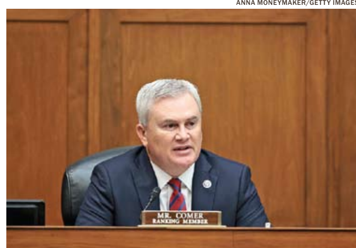
Ranking member Rep. James Comer (R-Ky.) at a hearing with the House Committee on Oversight and Reform in the Rayburn House Office Building in Washington, on Nov. 16, 2021.

The Holman Rule provides an exception to the long-standing House