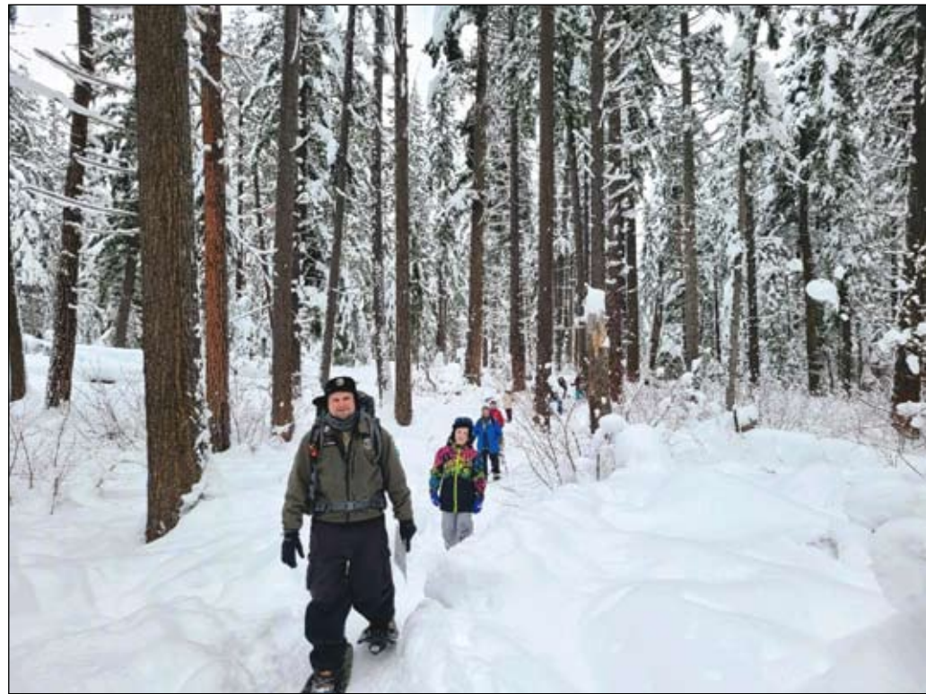
Participants snowshoeing on a First Day Hike.

WENATCHEE VALLEY SPORTSMEN SHOW CANCELLED - After a two-year hiatus due to the Covid pandemic, the Wenatchee Valley Sportsmen Show was going to take place at the Town Toyota Center from January 6 - 8, 2023, a new date for the show that would have made this the first sportsmen's show of the year in the Pacific Northwest.