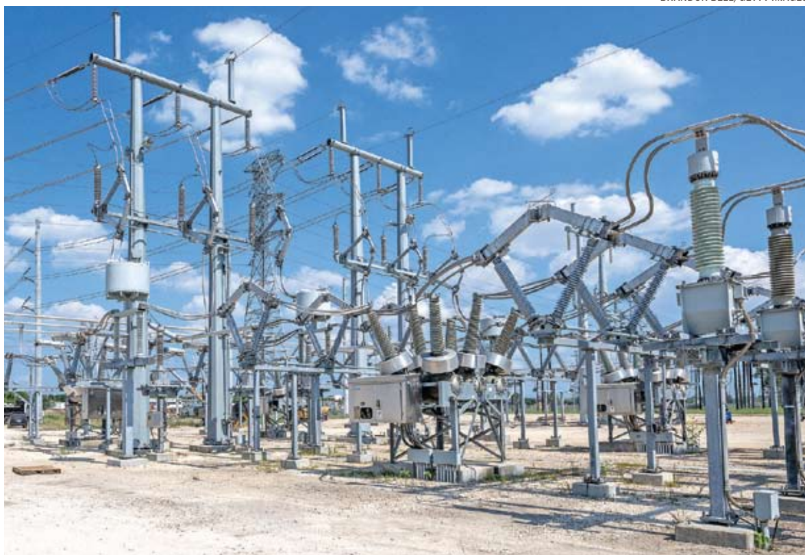
▲ An electric generator in Houston on June 9, 2022.

“It’s a process with numerous safeguards, but that also means it takes more time. It’s reasonable to think that we’ll start seeing impacts in the next few years,” he said.