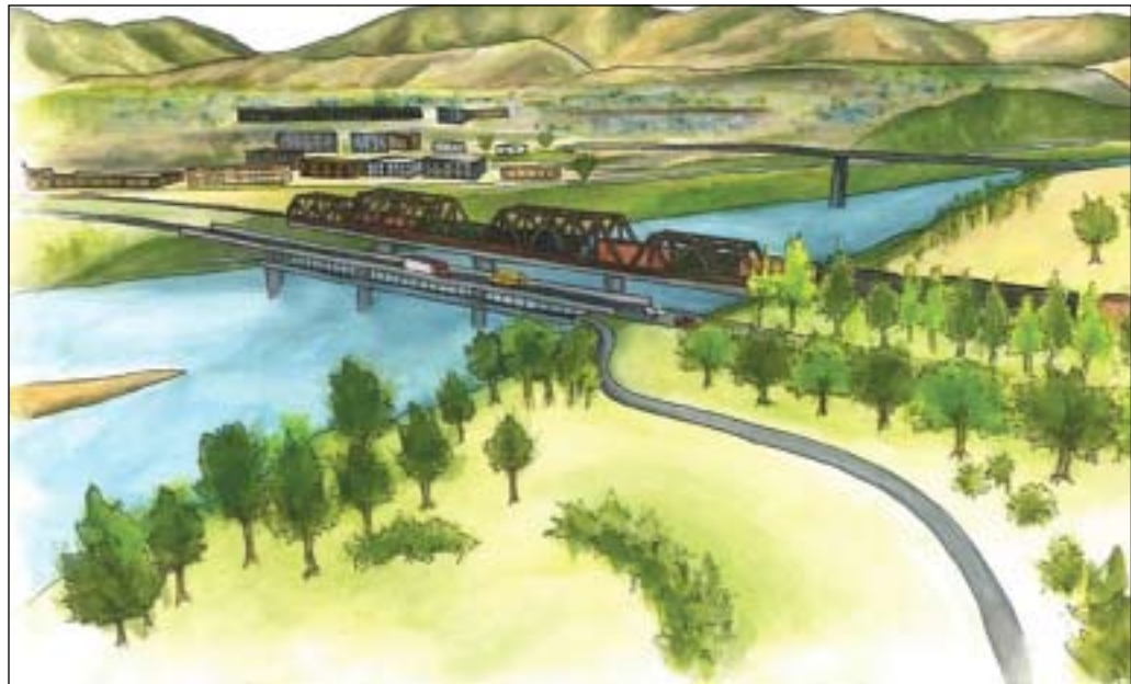
ABOVE: The proposed Confluence Parkway would provide a much-needed second bridge across the Wenatchee River, a widened pedestrian bridge, and a roadway with a direct connection to the U.S. 97A/US 2 Interchange and Odabashian Bridge.