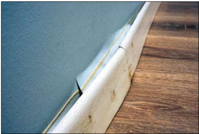
FEMA says floodwater only needs to get a mere 3 inches high to make it likely that you'd need to replace drywall and baseboards.

1. Homeowners insurance policies cover flood damage. A typical homeowners policy covers water damage from a sink or bathtub overflowing but won't help with flood damage caused by storms – something many homeowners only discover after it's too late. However, some insurance companies offer coverage to help fill the gaps, so you don't have to pay out of pocket for repairs and replacements. For example, Erie Insurance now offers Extended Water coverage, which covers dam-