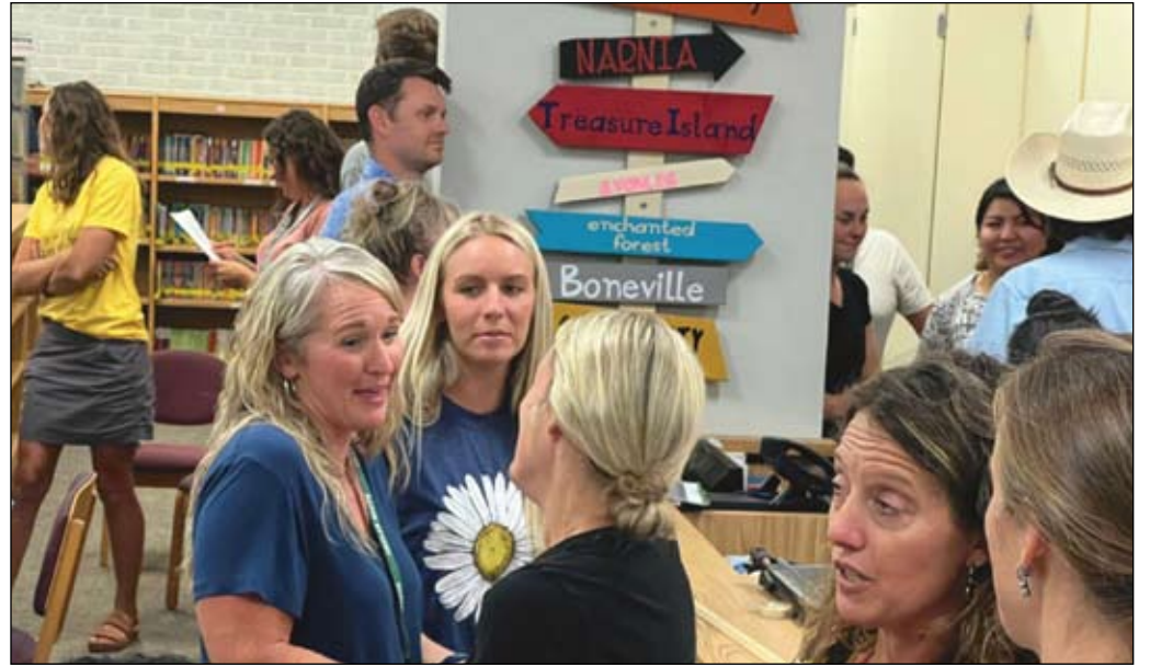
Morgen Owings Elementary School teachers participate in a professional learning study in August before the start of the school year.

directors and district leadership continue to place a high value on student achievement. In fact, our newly adopted theme for everyone in our system is: Achieve, Believe in their potential, and Contribute compassionately to their community. It's as simple as ABC." Lake Chelan School District, established in 1892, serves approximately 1,265 students, boasting a remarkable 97 percent graduation rate within four years. Furthermore, over 50 percent of high school students are enrolled in no-cost, college-level coursework, according to OSPI data. For more information and updates, you can follow LCSD on Facebook, Instagram, or visit their website at www.chelan-schools.org .