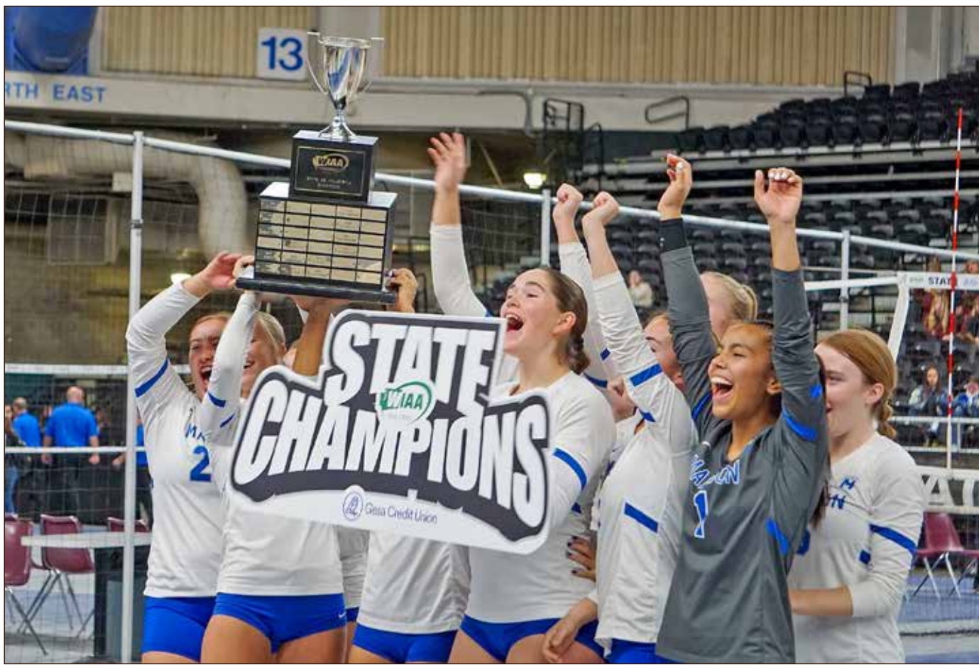
The Mason High School girls volleyball team celebrates after winning the state championship.