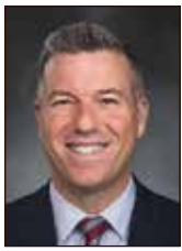
Sen. Brad Hawkins Point of View

For legislators, the time of year is quickly approaching to gather in Olympia for the annual process of discussing, debating, and updating state laws. The Washington State Legislature convenes annually each January but alternates between longer sessions of 105 days when first developing the state's two-year budgets and shorter sessions of 60 days in the years it updates those budgets. For the upcoming session, the Legislature will convene on January 8 for 60-days.