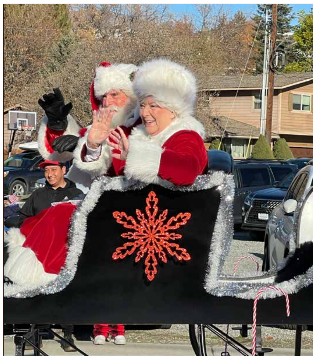
Santa and Mrs. Claus greet cheerful community members beneath a beautiful blue sky.