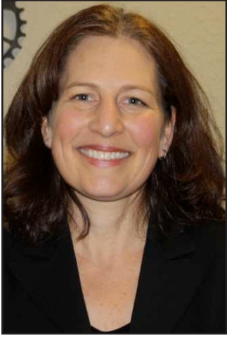
Dr. Kim Schrier

met with his office when the first Trumpcare bill was introduced and explained, along with three other doctors, all the ways that this bill would be bad for the district and bad for the country. Two days later, he voted for it in committee anyway. That was the last straw for me. We deserve better. We deserve representatives who will fight for us, and I'm stepping up to do that for the families in this district.