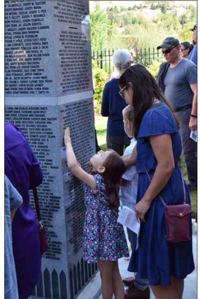
A heartfelt touch even by the youngest who came for the 9/11 dedication.