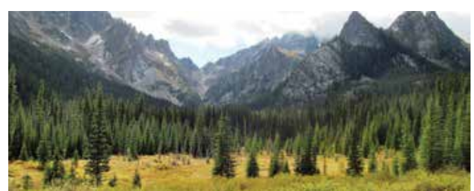
A view of the Enchantments along the trail to Stuart Lake

SPOKANE • COLVILLE • REPUBLIC • DEER PARK • WENATCHEE 509-782-5071 • 1-800-845-3500