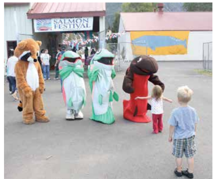
Colorful characters greet children of all ages to the annual Salmon Fest