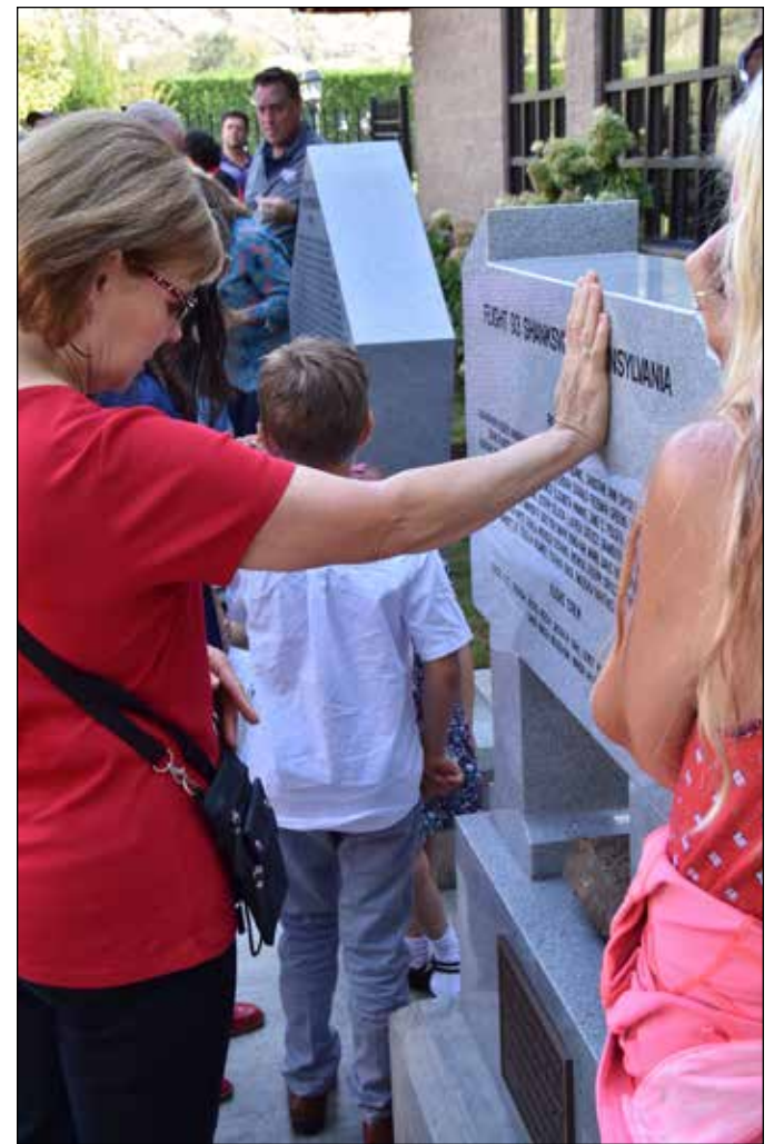
After the 9/11 Dedication Ceremony members of the audience came up for a touch and a prayer.