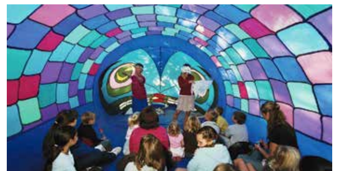
In this colorful 30-foot long nylon inflatable Salmon Tent, audiences will be entertained with a variety of meaningful stories. It's entertainment for the whole family in a unique setting.