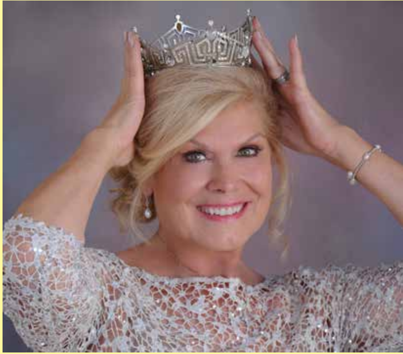
SUBMITTED BY LAUREL SCHAEFER-BOZOUKOFF