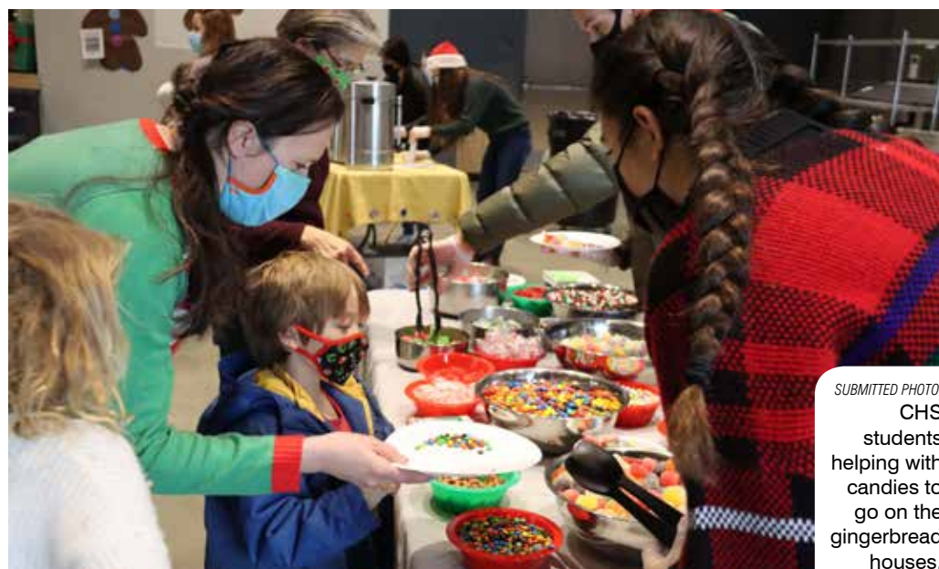
CHS students helping with candies to go on the gingerbread houses.