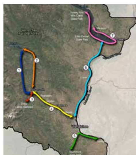
Graph of the Pathway Corridors include: Leavenworth to Lake Wenatchee West, Leavenworth to Lake Wenatchee East, Icicle & Leavenworth Roads, Leavenworth to Wenatchee, South of Wenatchee, Wenatchee to Lake Chelan, Shores of Lake Chelan.

The majority of respondents stated that they would use the pathways for exercise and recreation, with the second option used for commute.