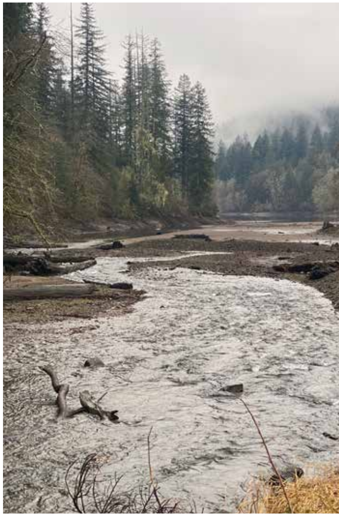
Mouth of Speelyai Creek during the drawdown at Merwin Reservoir