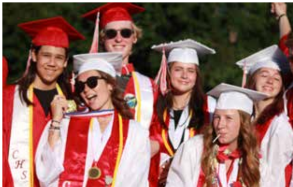
Big smiles all around.