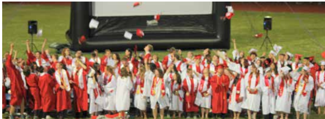
Hats off to the Graduates