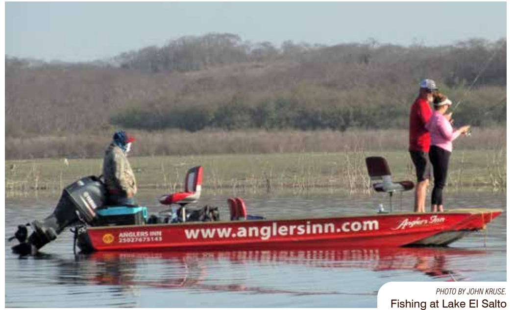
Fishing at Lake El Salto