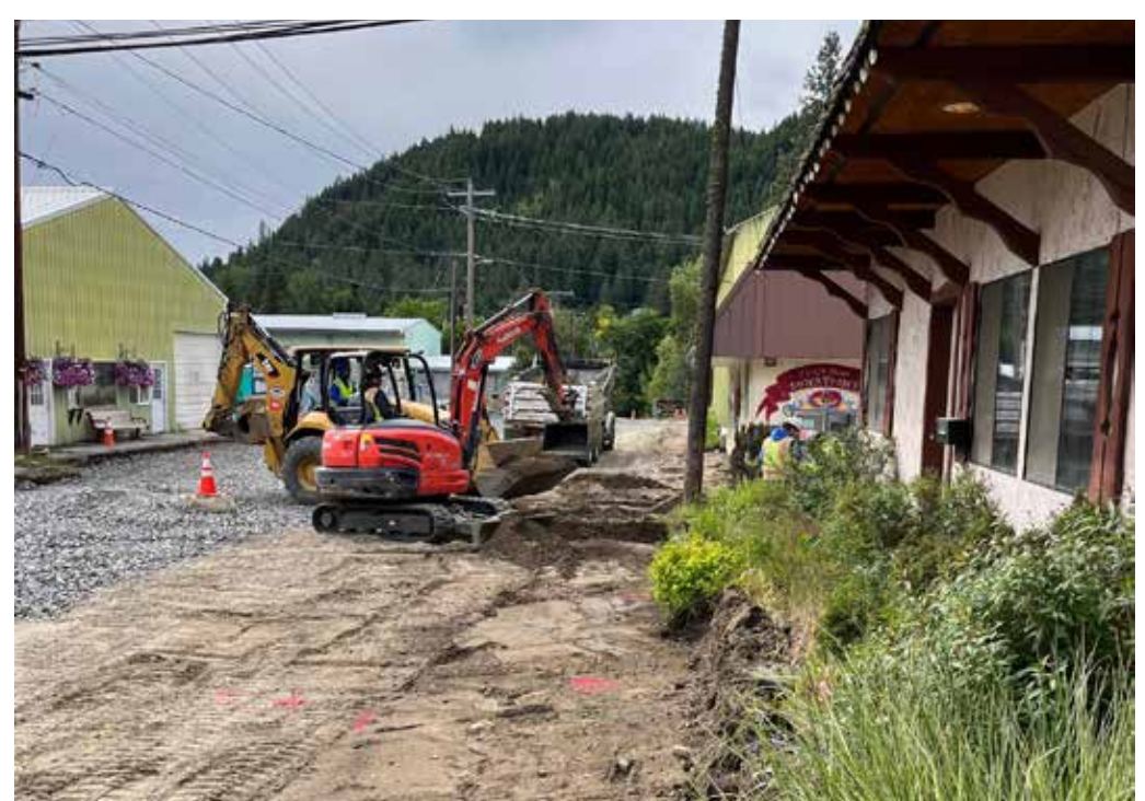
14th Street renovation by Smith Excavation will now be removing sidewalks from June 13 to June 16th. There will be limited access. All renovations are still on schedule and to be done by June 30th.