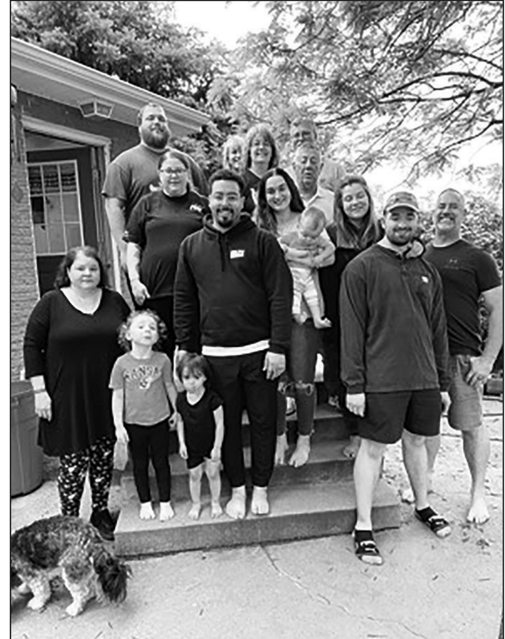
FAMILY —A group shot of part of the family during a get-together in Ulysses.