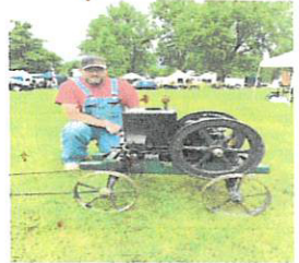
1916 Fairbanks Morse 1 1/2 HP Style Z