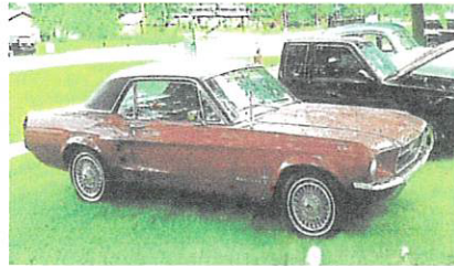
1967 Ford Mustang Coupe