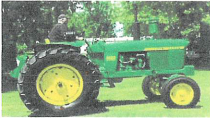
1967 John Deere 4020