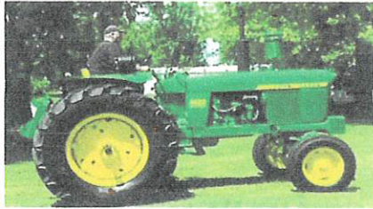
1967 John Deere 4020