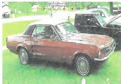
1967 Ford Mustang Coupe