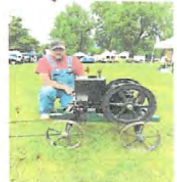
1916 Fairbanks Morse 1 1/2 HP Style Z