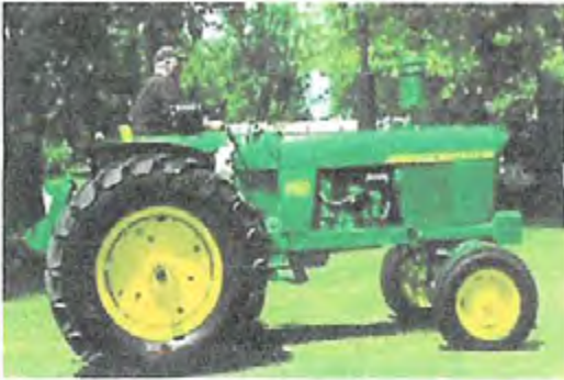
1967 John Deere 4020