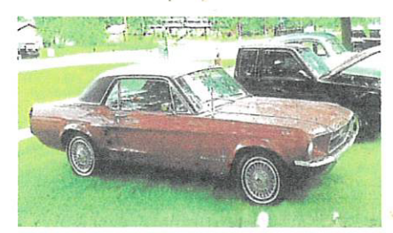
1967 Ford Mustang Coupe