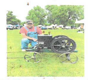
1916 Fairbanks Morse 1 1/2 HP Style Z