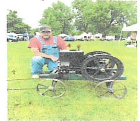
1916 Fairbanks Morse 1 1/2 HP Style Z