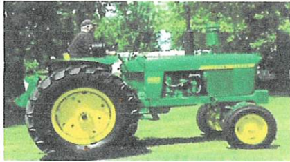
1967 John Deere 4020