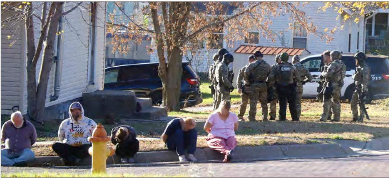
Members of the Lee County Special Response Team gather after conducting a “high-risk” search of a home in the 3000 block of Avenue J Tuesday morning. Several individuals were detained.

Provider-based refers to the billing process for services received in a hospital-owned medical practice that is a clinically integrated department of the hospital, or outpatient clinics that are actually part of the hospital. Officials said last week in an emailed statement to Pen City Current that the provider-based billing is the national model of practice for healthcare organizations that provide both hospital and physician services to their patients. “Southeast Iowa Regional Medical Center is taking proactive steps to ensure high-quality care remains available to all of our patients. We strive to maintain a high level of physician services in our communities. By converting to a provider-based billing model, Southeast Iowa Regional Medical Center is ensuring it is reimbursed fairly for services it provides,” the statement indicated.