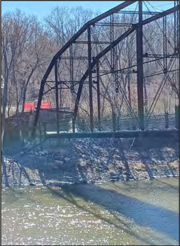
On Feb. 27th, the bridge over the Skunk River in northwest Lee County has slipped off its southern abutment and is sitting on the embankment about 12 feet below where it was previously.

Jan. 18 - Webviews: 4,469, Facebook: 15,762