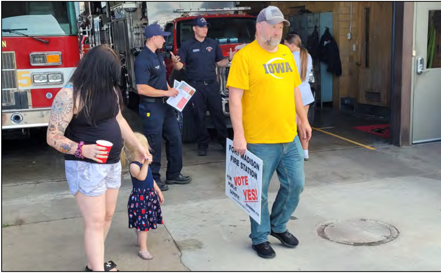
A Fort Madison resident leaves the Open House at Fort Madison Fire Department with a yard sign asking residents to support the referendum on the ballot Nov. 5.