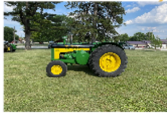
1958 John Deere 830