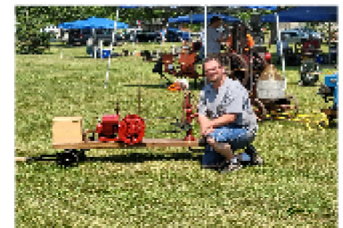
1926 1.25 HP Galloway Handy Andy