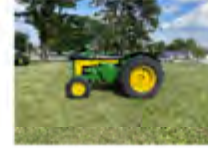
1958 John Deere 830