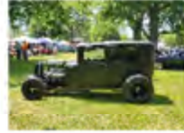
1931 Ford Model A