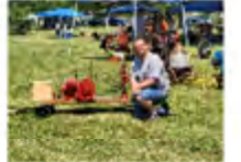
1926 1.25 HP Galloway Handy Andy