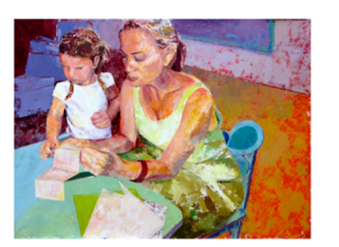
Exhibit Viewing: May 1 through May 30, 2024 Tue – Sat 10am – 5pm

Opening Reception: Thursday, May 2 5-7pm Lunch ala Art Friday, May 24 noon FINALE Friday, May 24 7-9pm