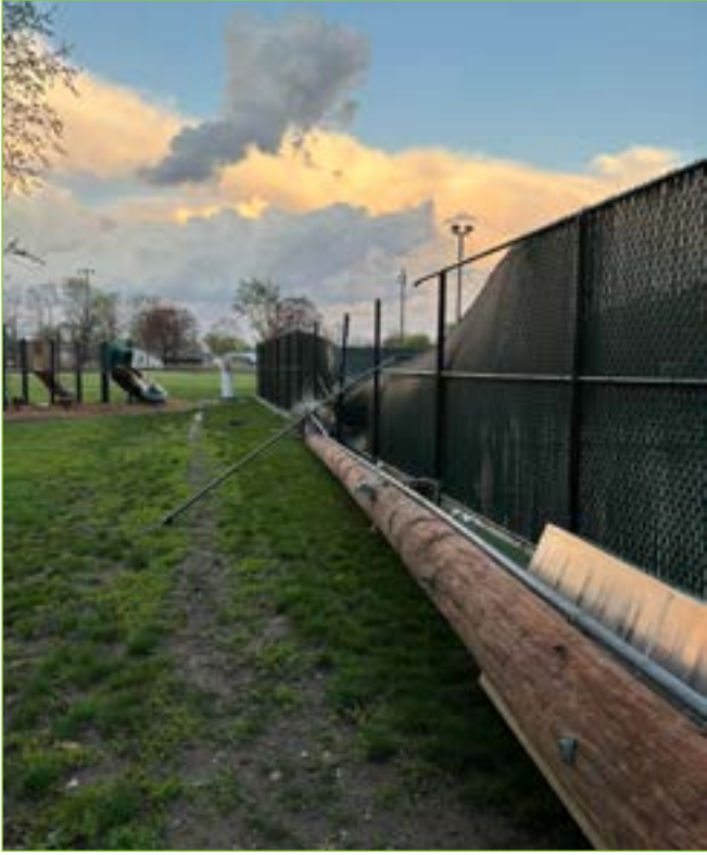
A severe weather alarm pole fell during a late evening storm that hit Fort Madison Tuesday. The pole damaged fencing on the new city pickleball courts and possible one or two of the courts.