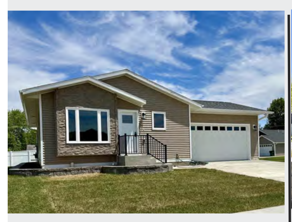
1 Green Oak Court Fort Madison, IA