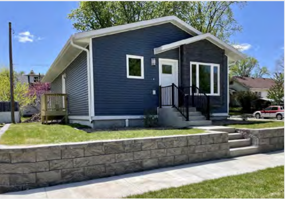
236 Ave E Fort Madison, IA