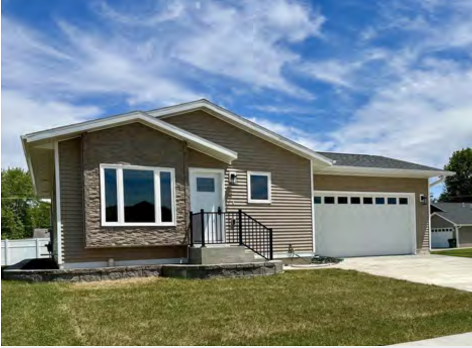
1 Green Oak Court Fort Madison, IA