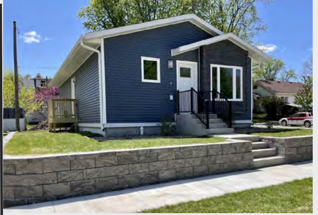
236 Ave E Fort Madison, IA