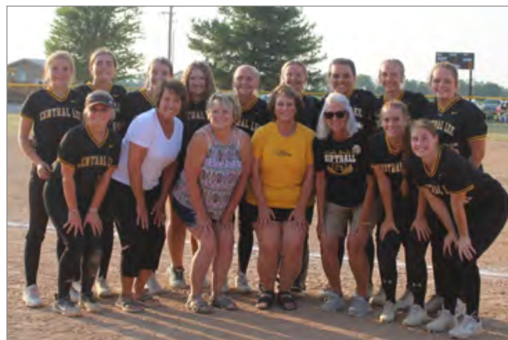
Members of the Central Lee girls' 1979 Blackhawk Conference title team pose with the 2023 SEI Superconference champions Friday at Central Lee High School.

“I take a lot of the blame in that loss. I had some people in the wrong spots in the field, but we keep a pretty good score sheet and I’ll be spending a lot of time with that over the next few days.”