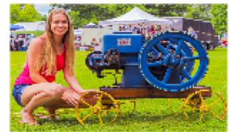
1920 Alamo Blue Line Type A 2 H.P.