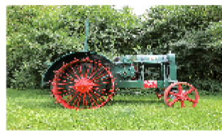
1928 Hart Par Model H