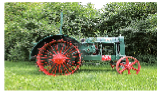
1928 Hart Par Model H