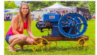
1920 Alamo Blue Line Type A 2 H.P.