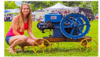
1920 Alamo Blue Line Type A 2 H.P.