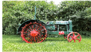
1928 Hart Par Model H