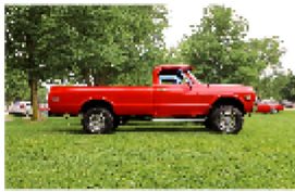
1972 Chevy C 10 4X4