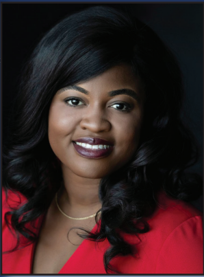
Deidre DeJear Candidate for Governor

is proud to present our 2022 Candidates!