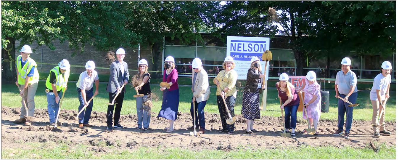
In one of the best grip-n-grins ever, school board members actually throw dirt with the symbolic shovels as the Fort Madison Community School District breaks ground at FMHS Tuesday.

SEIRPC operates the SEIBUS public transit service for Des Moines, Henry, Lee, and Louisa counties. Services are available Monday-Friday in all four counties and are reservation-based. Services offered include: In-town, Town to Town, County to County, shopping trips, medical transportation to every southeast Iowa medical center and clinic, and the Iowa City medical shuttle, and any other need. Call 1-866-753-5107 to reserve your trip today.