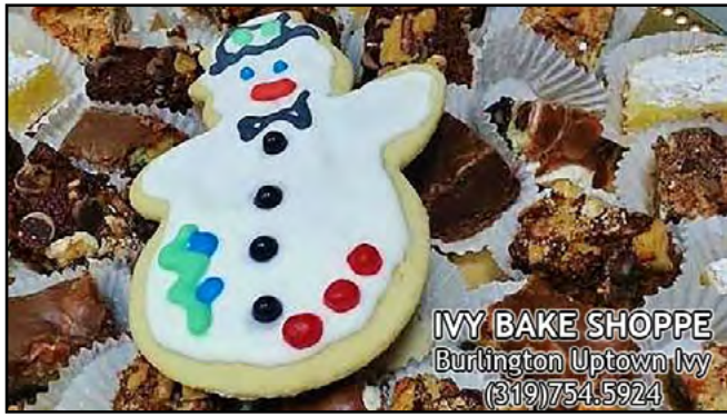
IVY BAKE SHOPPE Burlington Uptown Ivy (319)754.5924

Remember the original Ivy for your holiday desserts, sweet trays, catering, & gift certificates. Order yours by Tuesday, December 21st. Call us at Burlington Uptown Ivy (319)754.5924 or visit us at 514 Jefferson Street, downtown Burlington. Visit us online at www.ivybakeshoppe.com .