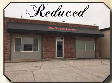
939 Avenue G Turn Key Office Space Listing #20165675