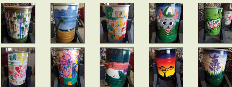
These backyard compost bins were made by students at the Keokuk Christian Academy & are now available for purchase.

Backyard composting improves soil quality & makes for healthier plants!