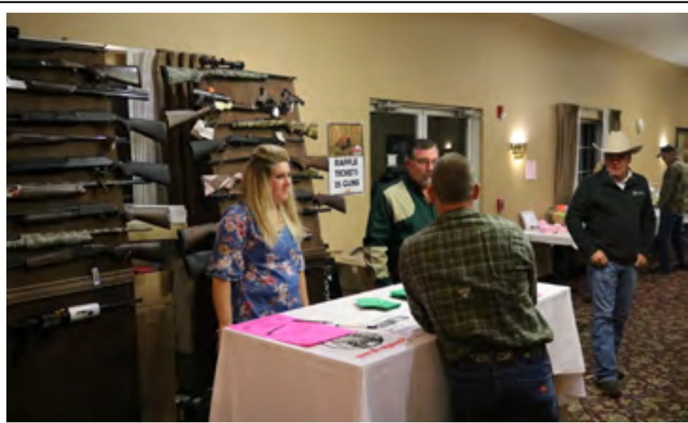
It was standing room only at this year's annual Pheasant's Forever dinner at the Comfort Inn and Suites on Saturday. Above, attendees talk with the hosts of the gun raffle and, in the background, silent auction bids are taken on more than 50 gift baskets.