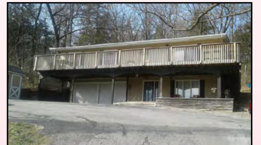
3BR • 1.75BA • 2 car garage 1,772 sq. ft. • 0.57 acres

Great family home with LOTS OF NEW! New kitchen, bathroom, windows, most flooring, wrap around deck, ceiling fans, light fixtures, furnace and central air! Beautiful neutral decor and window treatments make this a must see! All this and a 2 car heated garage.