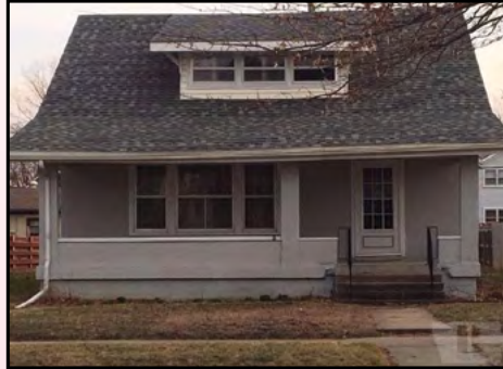
4BR • 1.50BA 1,706 sq. ft. • 7,250 sq. ft. lot

This spacious home has it all, the character of a turn of the century home; beautiful woodwork, beamed ceilings, window seat, columns, and large covered front porch, yet also includes MANY updates. Call today for your private viewing!