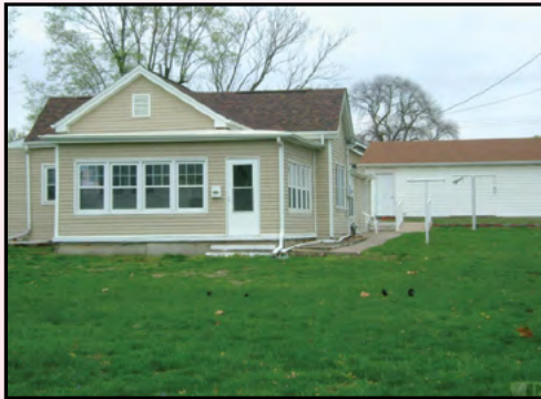
3BR • 1BA • 2 car garage 1,488 sq. ft. • 16,247 sq. ft. lot

Has been owned by this seller since 1960!!! Large eat-in kitchen with newly tiled floor includes stove, microwave, washer and dryer, main floor laundry (in bedroom), formal dining room with built-in hutch, and spacious living room. The house sits on a HUGE lot and has a nice 2 car garage in back. Home has Gas Heat and central air with maintenance-free siding on house and garage.