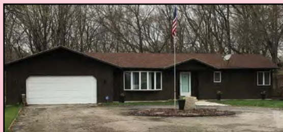
2BR • 2BA • 3 car garage 1,404 sq. ft. • 1.42 acres

Upgrades, improvements, updates...call it what you like, this home has had MANY in the last 2 plus years. This seller has completely refurbished the hill to the north of the home with new landscaping finishes. This is a must see property!!! It has enough room for your family and then some!!!