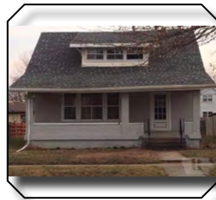
1712 Avenue E Listing #20164725; $92,000