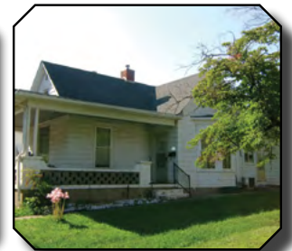
315 Avenue E Listing #20162543; $53,000