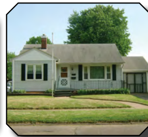
2634 Avenue G Listing #20165688; $94,500