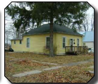
211 Main St., Montrose Listing #20164279; $38,500