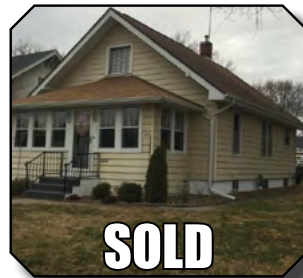
1821 Avenue E Listing #20164622; $88,000