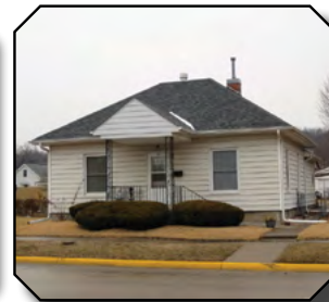
1315 Avenue E Listing #20164148; $72,500