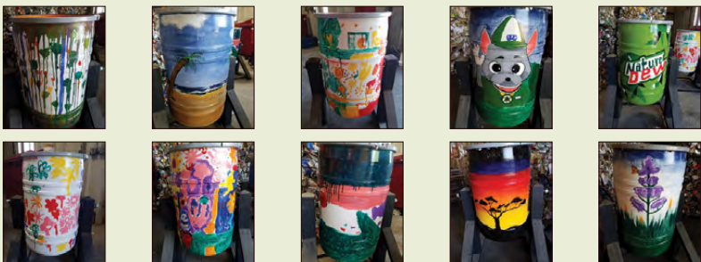
These backyard compost bins were made by students at the Keokuk Christian Academy & are now available for purchase.

Backyard composting improves soil quality & makes for healthier plants!