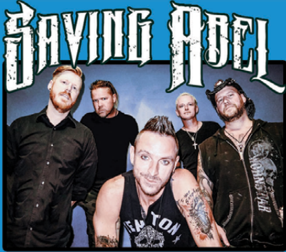
THE MEMPHIS DIVES JIVE RADIO