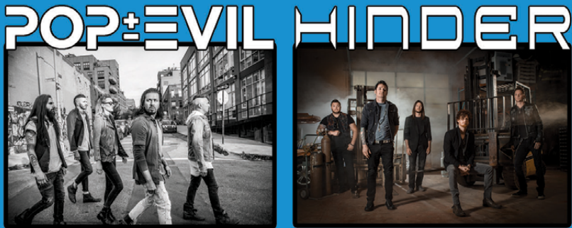
POP EVIL HINDER