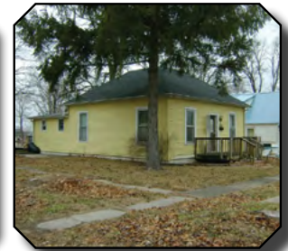
211 Main St., Montrose Listing #20164279; $38,500