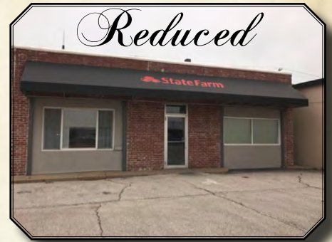
939 Avenue G Turn Key Office Space Listing #20165675