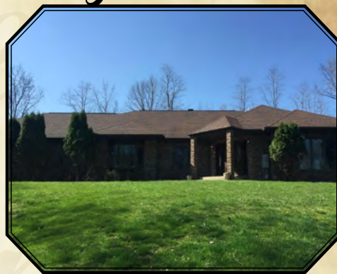
15 15th Street • Fort Madison 3BR • 4BA • 3 car garage Listing #20166815