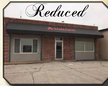
939 Avenue G Turn Key Office Space Listing #20165675