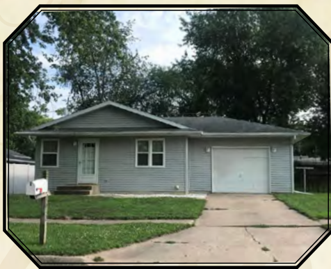
3032 Avenue E • Fort Madison 3BR • 1BA • 1 car garage Listing #20166815