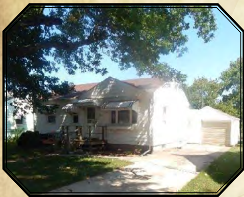
118 Avenue E • West Point 3BR • 1BA • 1 car garage Listing #20166662