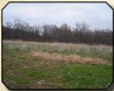
2188 Old Denmark Road E 14.65 acres • 638,514 sq. ft. Listing #20162574