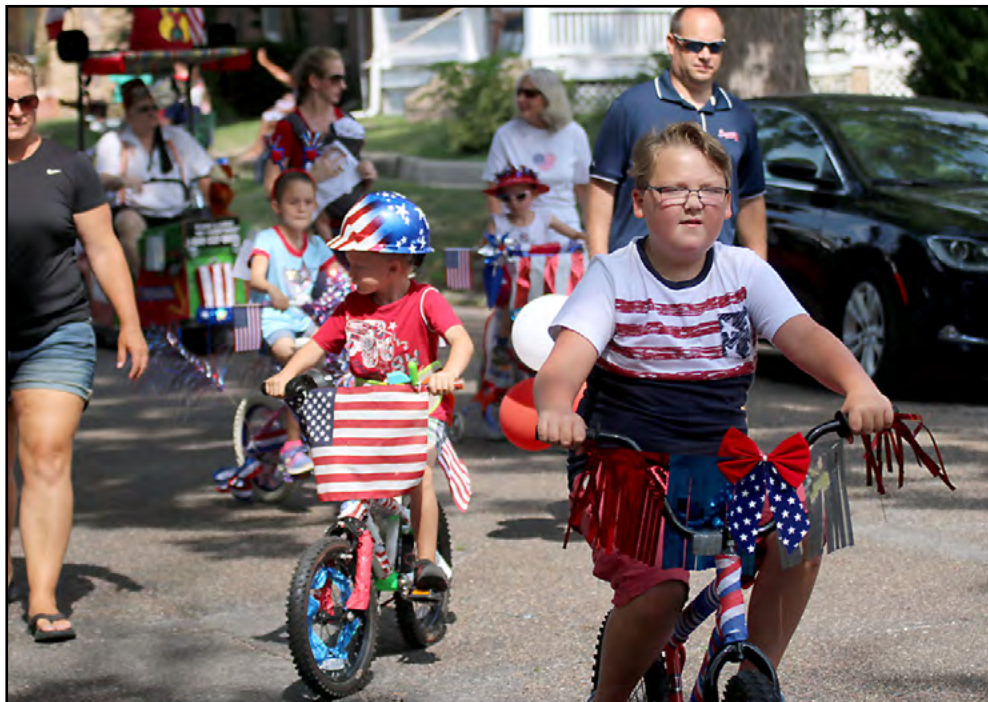
It's time for a drink for the girl in the decorated wagon division above, and at right, more decorated bikes and walking parents highlight the parade route.