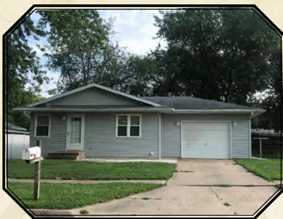
3032 Avenue E • Fort Madison 3BR • 1BA • 1 car garage Listing #20166815