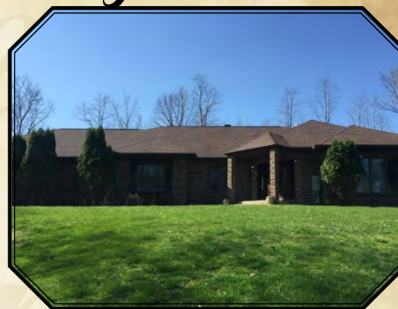
15 15th Street • Fort Madison 3BR • 4BA • 3 car garage Listing #20166815