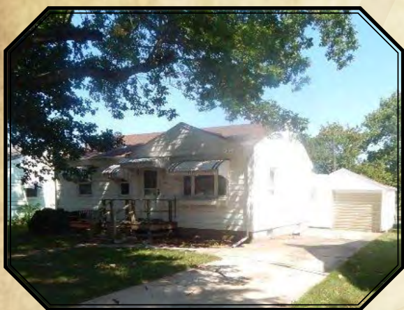
118 Avenue E • West Point 3BR • 1BA • 1 car garage Listing #20166662