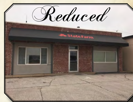
Reduced 939 Avenue G Turn Key Office Space Listing #20165675